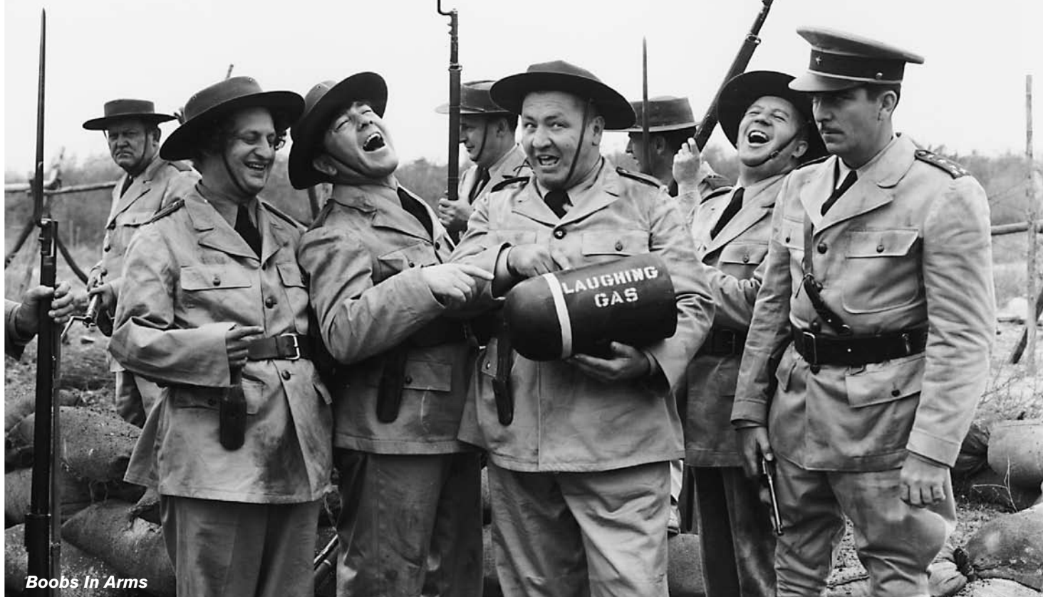
Boobs In Arms