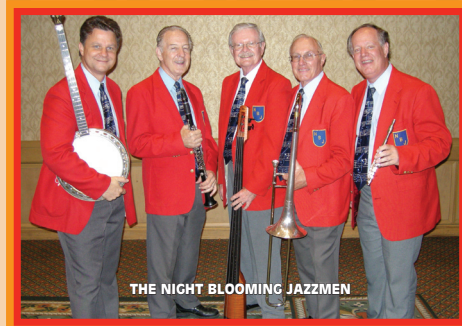
THE NIGHT BLOOMING JAZZMEN