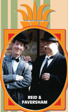
REID & FAVERSHAM